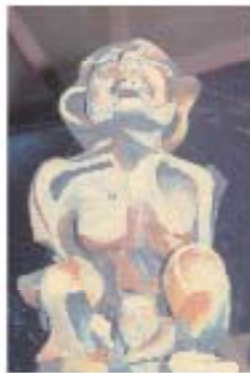
Zipporah Natal fertility goddess Predecessor of the Virgin Mary