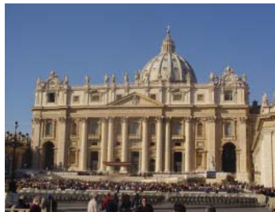
St. Peter's Cathedral (Vatican)

While we must certainly have the same courtesy, concern and love for our Roman Catholic friends and neighbors as we should for Muslims, Jews or any other non-Christians; we must definitely understand that they do not hold to the same biblical Christianity as we find in the Scriptures and represented in the confessions of the Reformation. As was noted in the