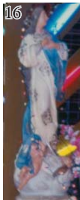
The Virgin Mary from the same church is paraded in the same manner as was the ancient fertility goddesses in ancient days.