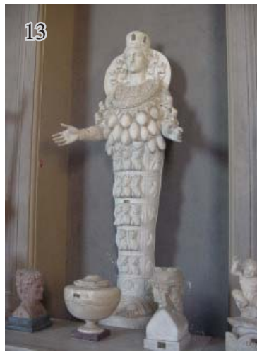
Diana or Artemis of Ephesians (Acts 19:35), Queen of Heaven - fertility goddess in Vatican Museum.