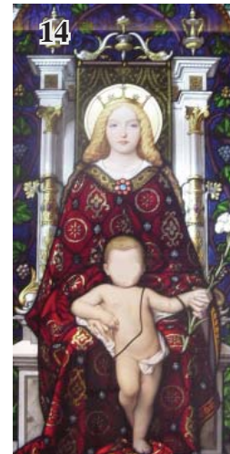
Mary Queen of Heaven in Vatican Museum.

Mary was declared to be the “Mother of God” by the Christian church in the fifth century at Ephesus. This is no coincidence because Ephesus was the home of a magnificent temple to the goddess, Artemis Diana, one of whose titles was “Queen of Heaven”.